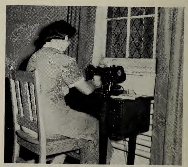
The Mercer has a work room, or factory equipped with modern machines to produce many articles from attractive dresses to bed linen. But instruction is also given to women interested in the operation of domestic sewing machines.